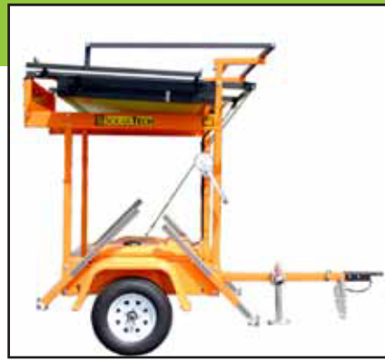
MB III lowered and folded compactly for transport.