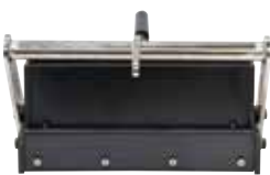
12 in SmartDie II