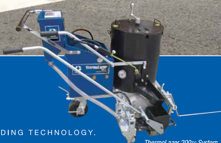
ThermoLazer 200rc System