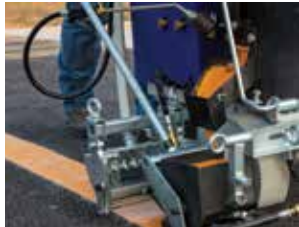
Excellent line quality.