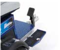
Dual Foot Pedal System (Patent 6,883,633)