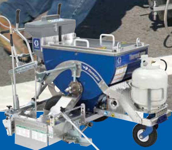
ThermoLazer 300rc System