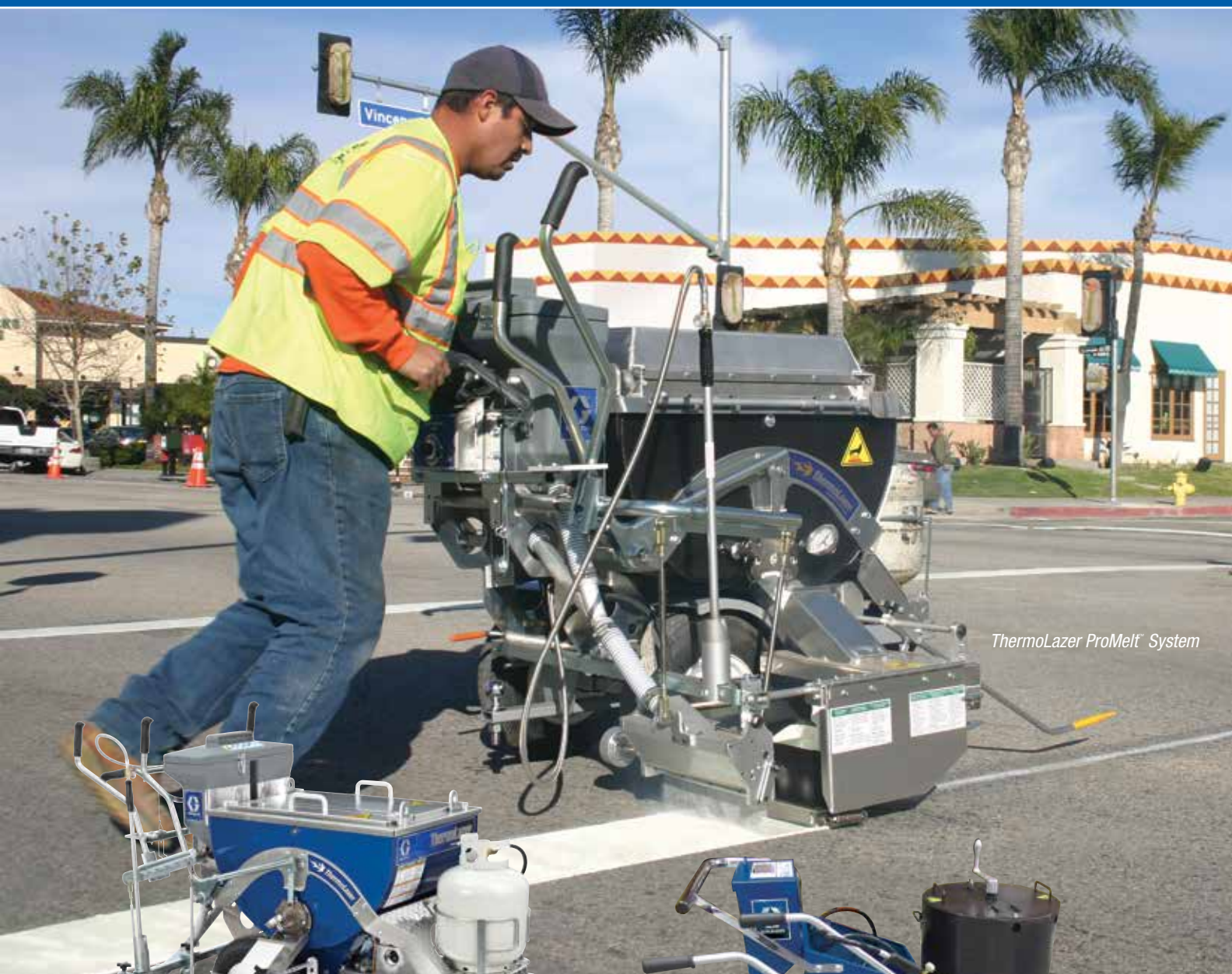
ThermoLazer ProMelt® System