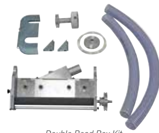
Double Bead Box Kit

24C528 Parts to upgrade ThermoLazer 300TC or ThermoLazer ProMelt System to double drop bead system.