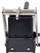
4 in SmartDie II

These hardened steel dies with an innovative, built-in mil adjustment system are built to last—exactly what you've come to expect from Graco.