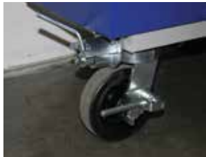
Rear Wheel System with release and brake.