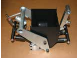
FlexDie—Steel die built to last!