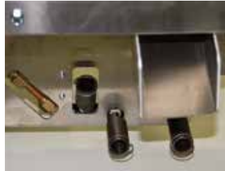
Tri-Flame Die Heat System