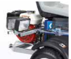
Break-A-Way Light System