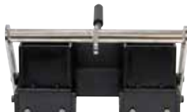
4 in x 4 in x 4 in SmartDie II